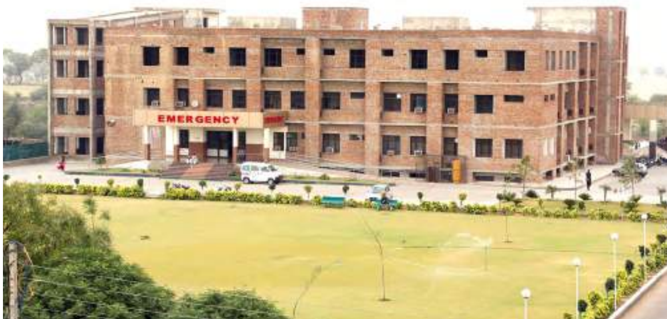
JCD Super Speciality Hospital and Trauma Center

The Dental College is attached to Jan Nayak Ch. DeviLal Superspeciality Hospital & Trauma Centre with 110 Indoor Beds for teaching general medicine & general surgery to BDS students. The Hospital is situated within the JCDV Campus & equipped with ultramodern facilities.